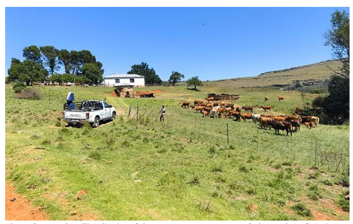
Shuna farm in the Elliot district of the Eastern Cape was awarded to 11 beneficiaries via the LRAD land reform programme in 2004.